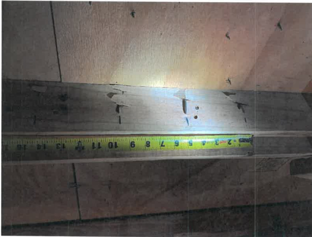
Figure 2 – Plywood Sheathing Nail Spacing (Typical)