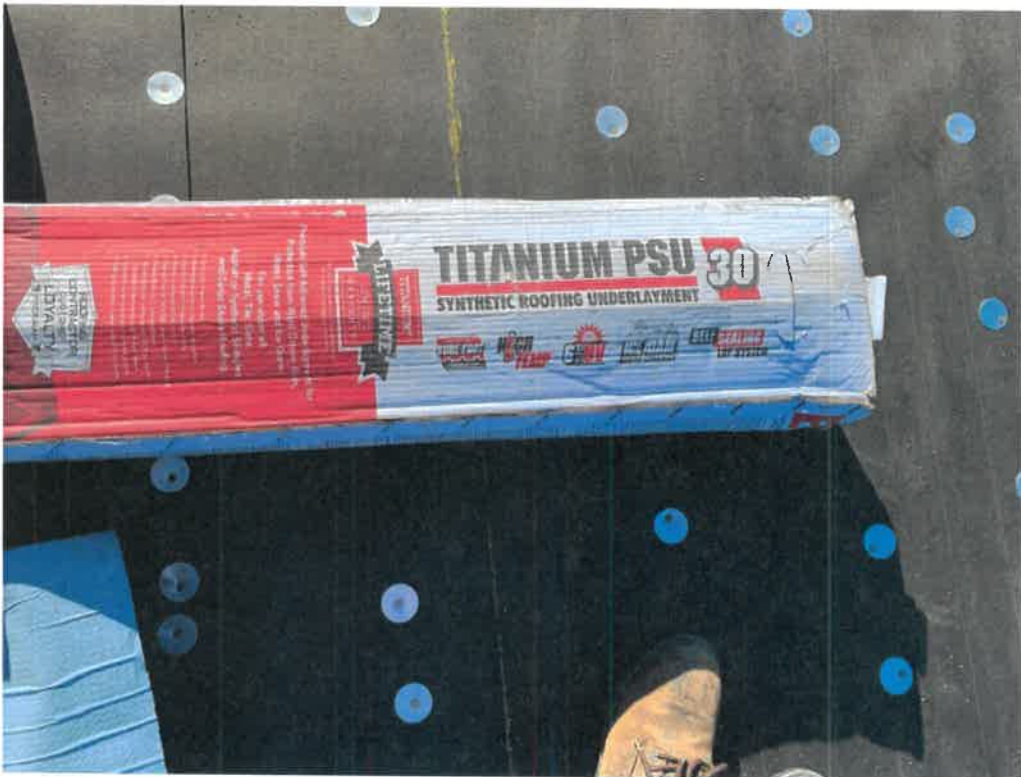
Figure 4 – Secondary Water Barrier at Sloped Section (Typical)