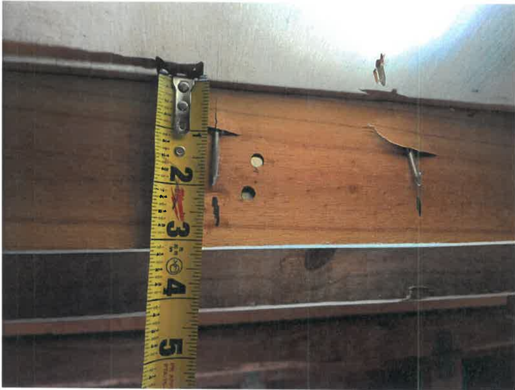
Figure 3 – Sheathing Fastener Size 8d Confirmed (Typical)